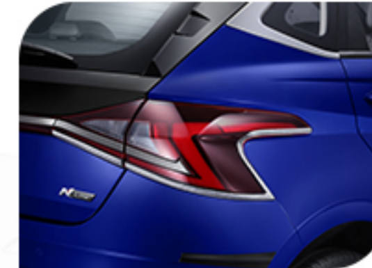
TAIL LAMP GARNISH