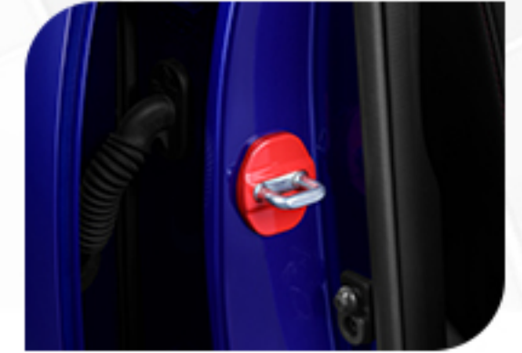
DOOR STRIKER COVER