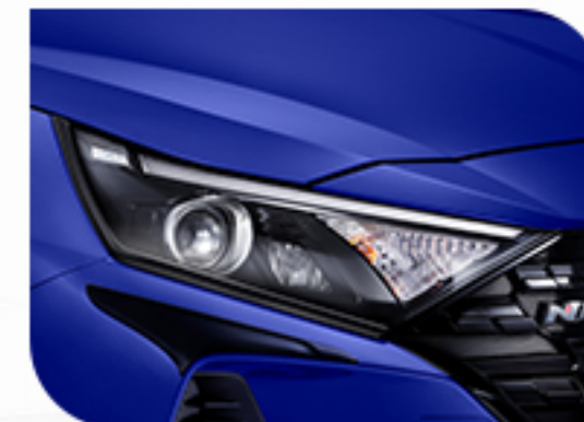
HEAD LAMP GARNISH- BLACK