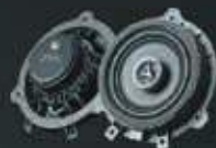
Part Name - - Morel HYU 5C Part Number--ACF65IH158 5.25" Coaxial Speaker