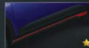
BODY SIDE MOULDING -BLACK