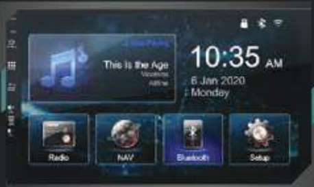
FT LAUDERDALE 900- 10 INCH + REAR CAMERA