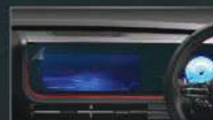
SCREEN PROTECTOR (INTEGRATED)