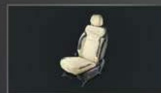
GREIGE & BLACK SC WITH_DET(PRE ) SAB