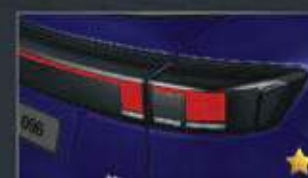
TAIL LAMP GARNISH