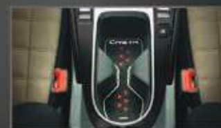
CUP HOLDER COASTER