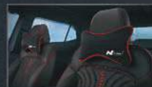
NECKREST WITH N LINE BRANDING