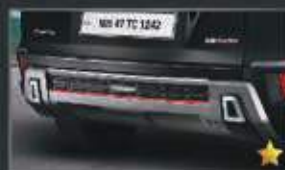
SKID EXTENDER REAR