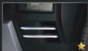
FRONT BUMPER BEZEL