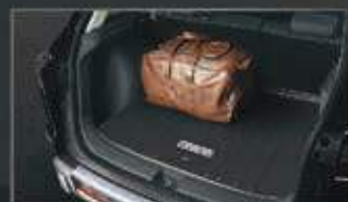
3D BOOT MAT