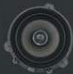
Part Name - - Morel HYU 6C Part Number--ACF65IH159 6.5" Coaxial Speaker

No need for supporting accessories (Wire, rings)