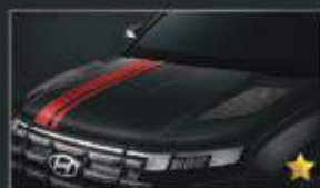
TWIN HOOD SCOOP