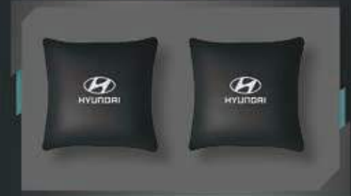
PREMIUM CUSHION PILLOW