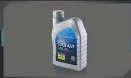
1 LITRE PRE MIX