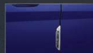
DOOR EDGE GUARD