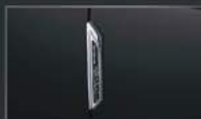
DOOR EDGE GUARD