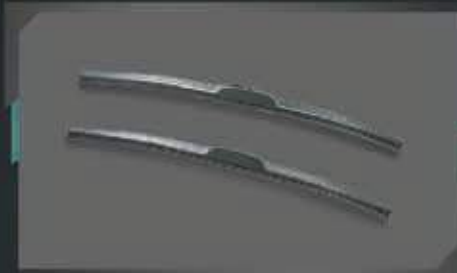
PREMIUM WIPER BLADE