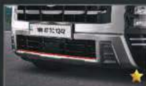
SKID EXTENDER FRONT