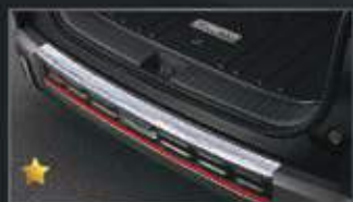
REAR SILL GUARD