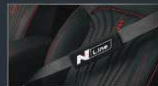
SEAT BELT COVER