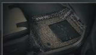
DUAL LAYER MAT