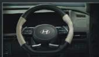
STEERING WHEEL COVER- BEIGE