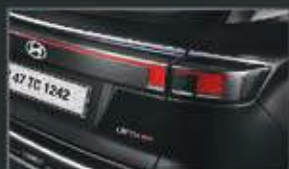
TAIL LAMP GARNISH