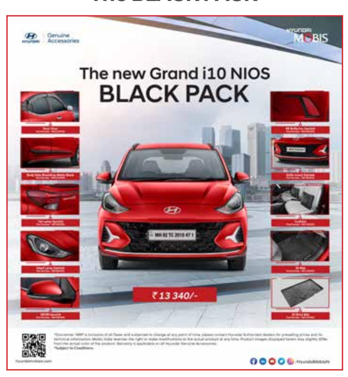
Choose the Black Pack for a bold and sophisticated look.