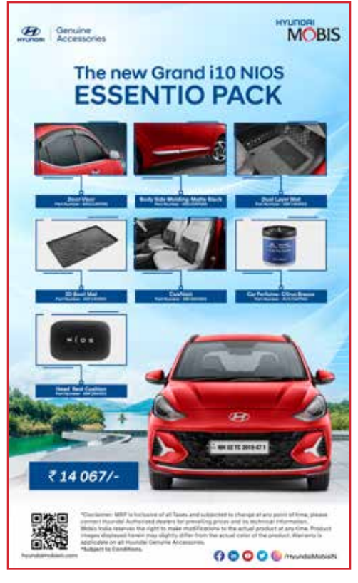
Opt for the Essential Pack to enhance practicality and functionality.