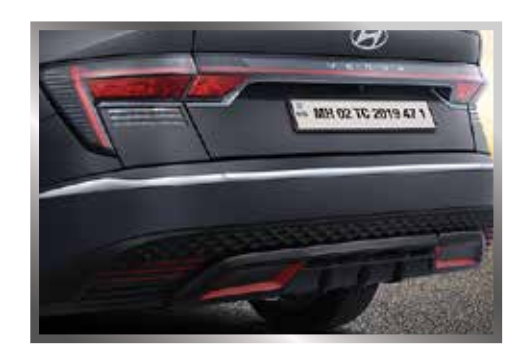
Rear Boot Garnish