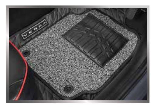
Dual Layer Mat